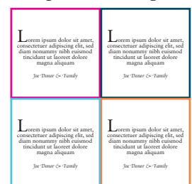
Sample - Quarter Page Ad